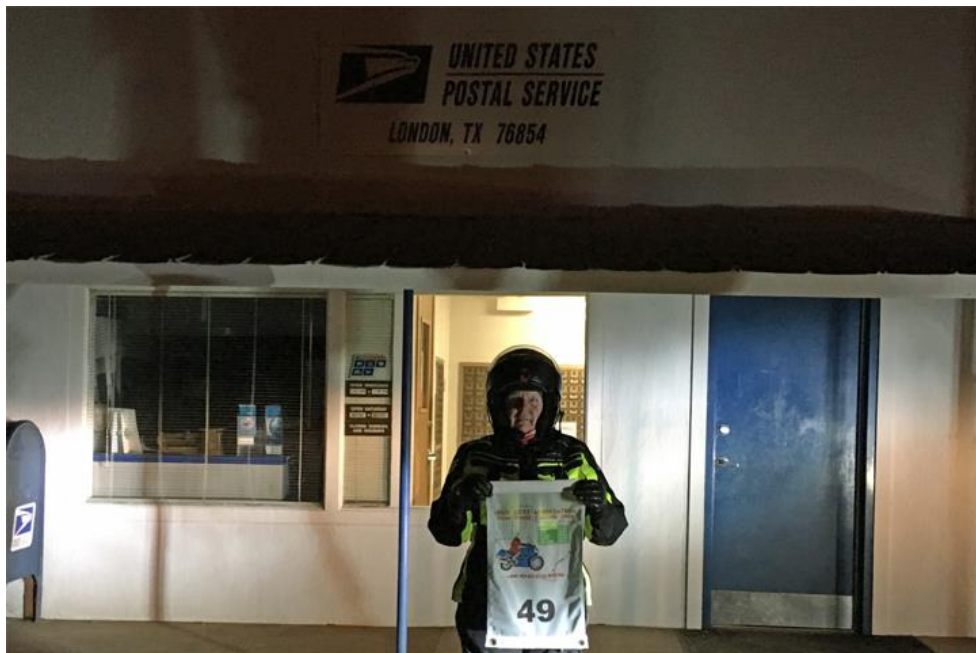
London Post Office

Although 150 riders were signed up to participate, we don't ride together. Everyone rides their own ride at their own pace. Really, the only time we would see other riders was when we arrived at the specific destinations required for the ride. Other than that, we would go hours without seeing other riders.