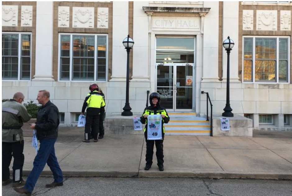
Paris, TX City Hall

And of course, the IBA has a sick sense of humor! They never make the ride easy! Our route would include 3 of the largest cities in the USA on a FRIDAY (Dallas, Houston and San Antonio)! Those B@$% @&+ $!