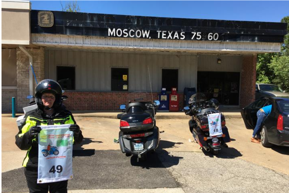
Moscow Post Office